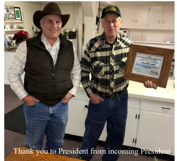
Thank you to President from incoming President.